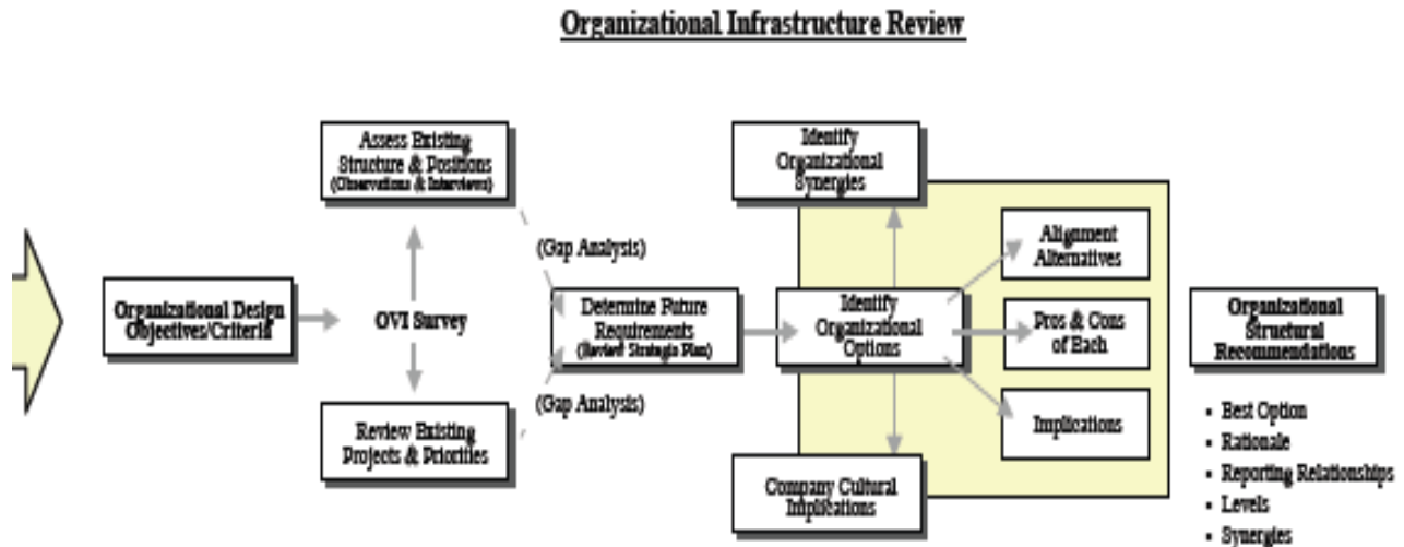
Fig II: Structure Follows Strategy (Elcock, 1996)